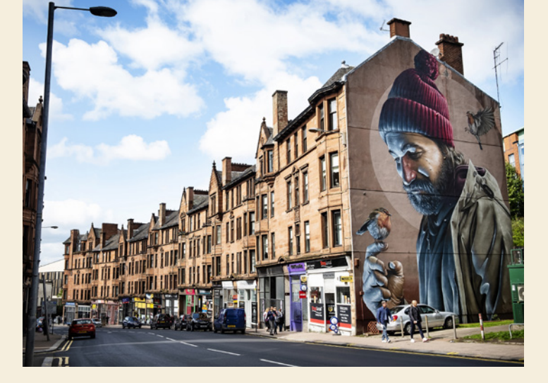
TOP: Many areas in Glasgow City feature stunning murals. BELOW: Dunluce Castle, a ruined medieval castle in Northern Ireland and the renowned geographic wonder Giant's Causeway.